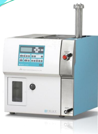
Recycling Preparative HPLC (Manual model) LC-9210NEXT