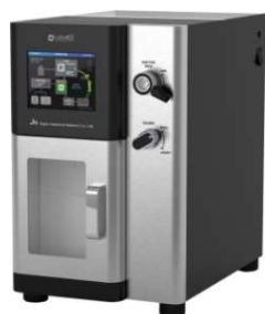
Recycling Preparative HPLC LaboACE LC-5060

Related product : Recycling Preparative HPLC Series