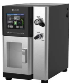
Recycling Preparative HPLC LaboACE LC-5060

Related product : Recycling Preparative HPLC Series